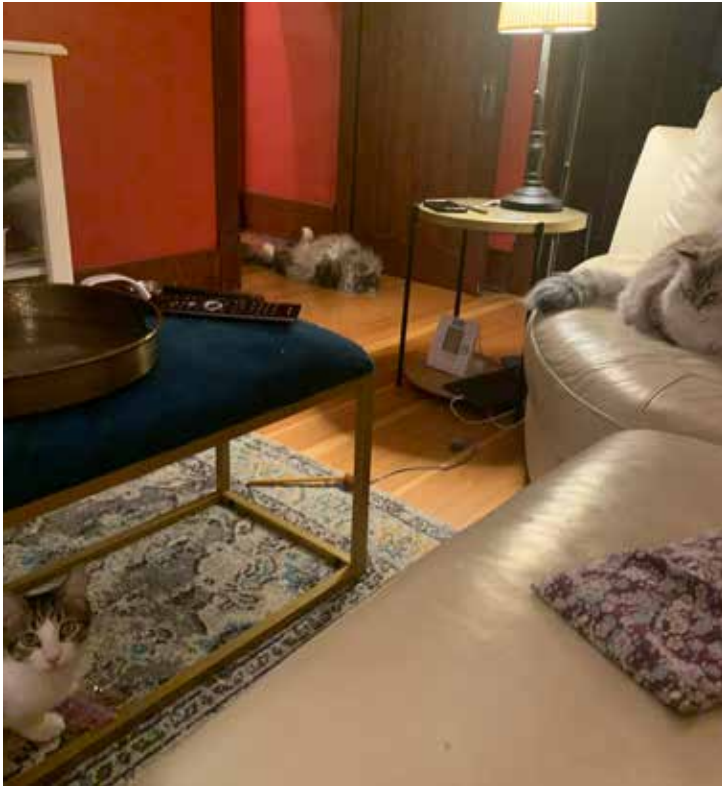
Arlo (lower left) with his sisters, Maizy (background) and Mia (centre right)