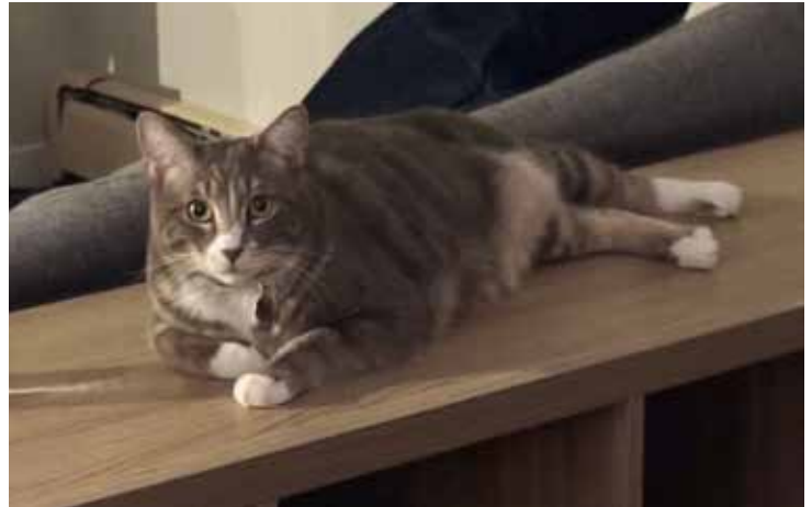
Gus likes to be on a level with his humans.