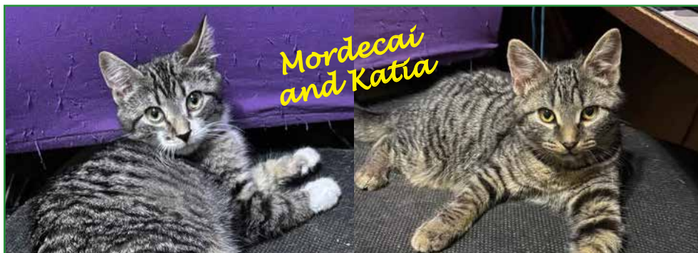
Mordecai and Katia

Would you like your future cat to be featured on this page next January? Look at who's available for adoption: https://pawsociety.ca/adoption-cats/