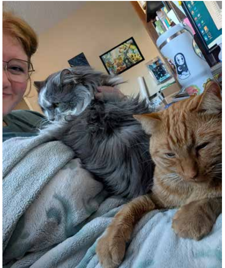
Ainsley (left) was right: Julien is a good fit.

Another PAW cat has found her family. Read about her adoption in the next issue of PAWPrints.