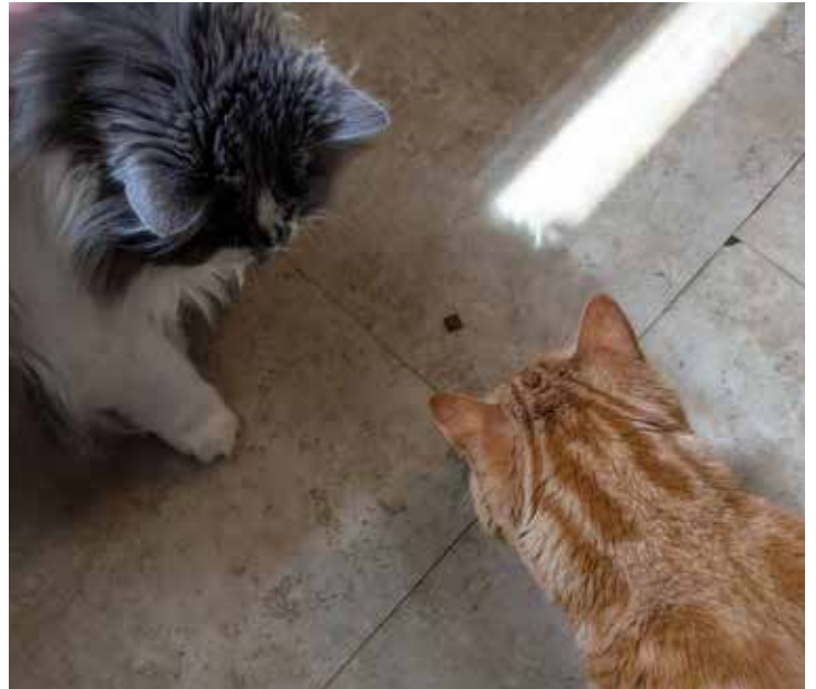
Above: Is it a matter of "What is it?" or "Who gets it?"