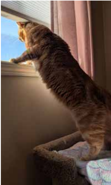
Things to see and places to explore in the new home